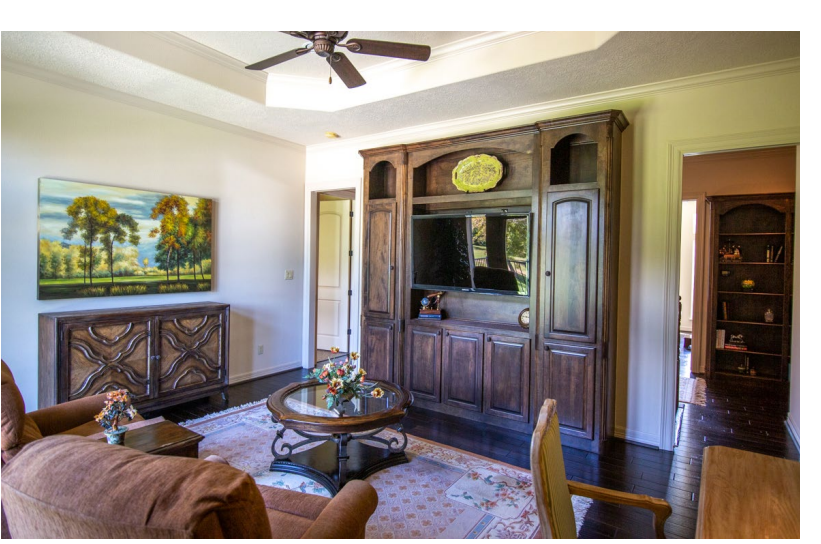
Accommodate all your guests with a private elevator across the hall.

The lounge could alter as an additional bedroom.