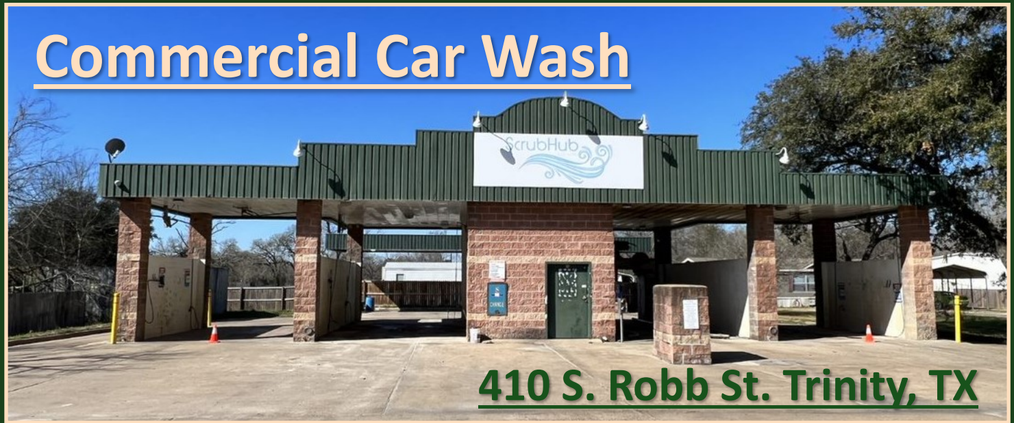
Robb St. | Trinity, TX