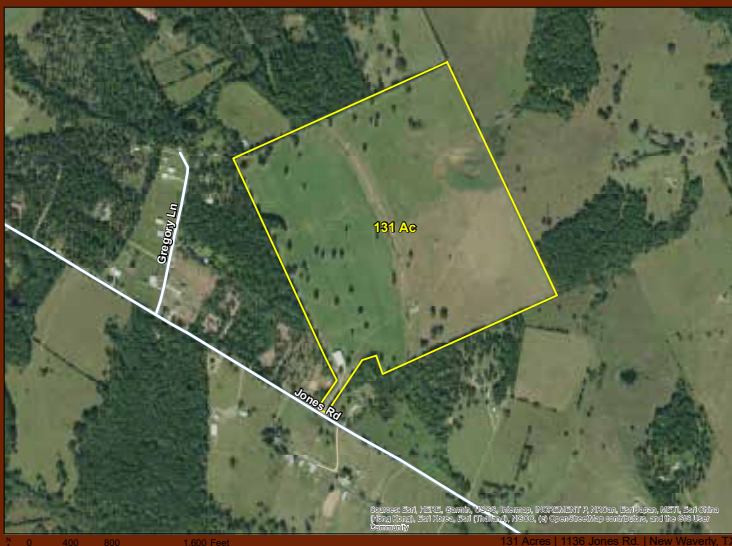
131 Acres | 1136 Jones Rd. | New Waverly, TX For illustration purposes only.