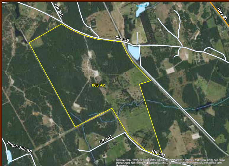
883 Acres | Burleson Co., TX For illustration purposes only

Scattered treed pastures bisected by a natural creek. 3 ponds/lakes. Fenced and cross fenced. 1 barn, 2 sheds, cattle pens, 2/1.5 residence (leased). Excellent access on paved County Road 316 and paved County Road 102. Frontage on the Burlington North Santa Fe RR. All close to, and with easy access to, SH 21 and SH 36.